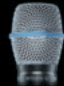
BETA 87A, BETA 87C