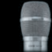
KSM9, KSM9HS (In Black or Nickel)

Also available with these Shure microphone cartridges