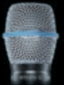
BETA 87A, BETA 87C