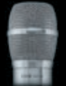
KSM9, KSM9HS (In Black or Nickel)

Also available with these Shure microphone cartridges